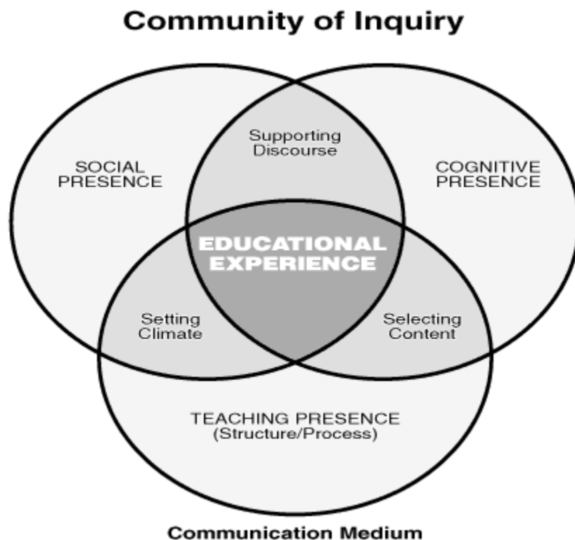
Figure 1. Elements of an educational experience (Garrison, Anderson, & Archer, 2001).

In its original formulation, the three presences were represented as overlapping and interacting processes that determined the quality of the online learning experience. The now-familiar diagram is shown in Figure 1 below.