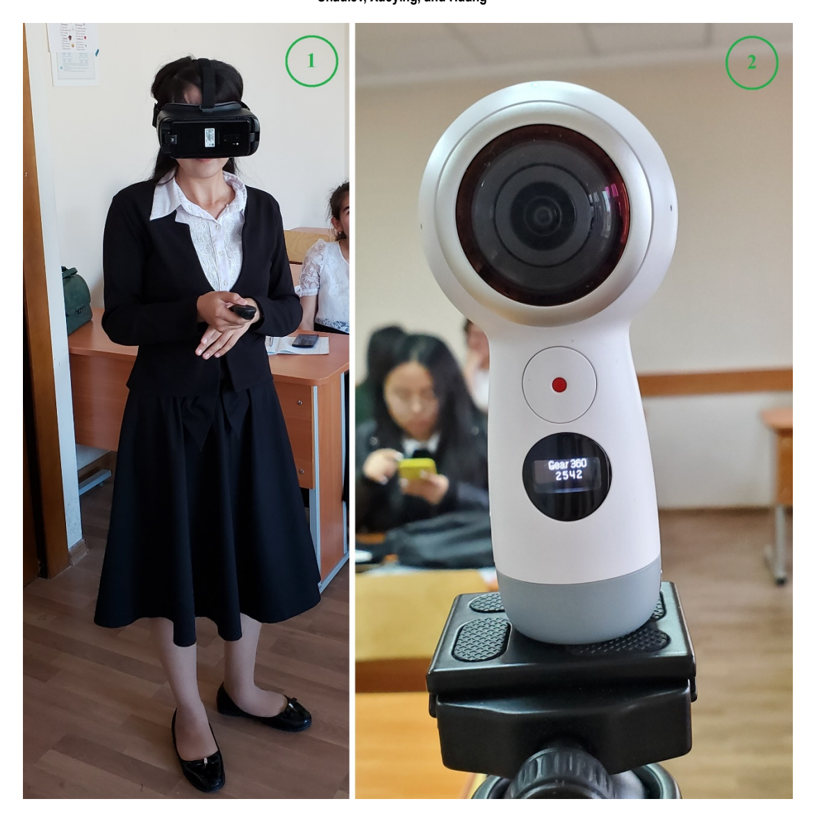
Figure 2. VR technology: (1) Samsung Gear VR, and (2) Samsung Gear 360.