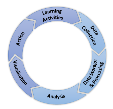
Figure 1 . The learning analytics cycle.