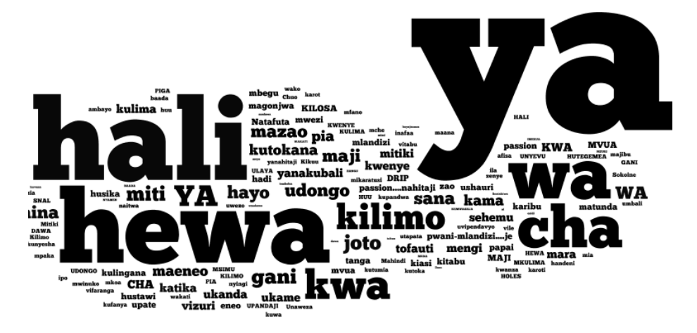
Figure 4 . Word cloud after analysis using Wordle.

This study has some limitations which need to be noted. According to Zhu, Rodríguez-Hidalgo, Questier, and Torres-Alfonso (2015) the study which deals with analysis of texts has limitations in terms of the following factors, namely: sample size, contextualized environment of the study, and Hawthorne effect. With respect to these factors, the study sample size was small and limited to 22 farmers who asked advisories related to "climate change." Secondly, the result of this study is applied to a specific setting and thus, cannot be generalized. Lastly, the results might be related to the so-called Hawthorne effect as the respondents who are either farmers, extension agents, and researchers were introduced to new method of agro-advisory system using ICT. This system was used to complement a conventional agricultural extension system and was not used on its own.