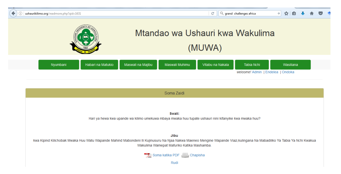
Figure 7. Advice from extension agent about what to farm after flooding has occurred in Kilosa.

Furthermore, farmers sought information about floods after it has occurred in 2016. The extension agent advised the farmer to farm crops that can yield in short periods of time (Figure 7).