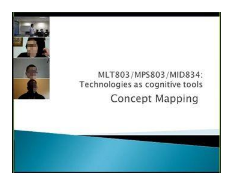
Figure 3. A screen capture of the instructor's computer.

Implementation. Three students attended this session at homes while the rest were in the classroom. Every online student successfully connected to the video conferencing room before the start of the lesson. As shown in Figure 3, their streaming videos were clearly displayed on the classroom projector. The instructor shared the PowerPoint slide with the online students using the tool Zoom. Both the online and classroom students could view the slide and the streaming videos. The instructional process was video recorded in Zoom and later uploaded to the course web site for the students to review.