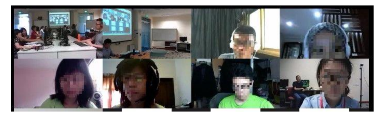
Figure 4. An illustration of the BSLE.

Implementation. Eight online students attended this session online. The instructor and most online students joined the video conferencing room before the lesson started. The instructor further reminded the online students to mute their mics. The student who complained about the sound problem attended this session from home again. He was happy with the improved quality of sound. Figure 4 shows what the BSLE looked like in this session.