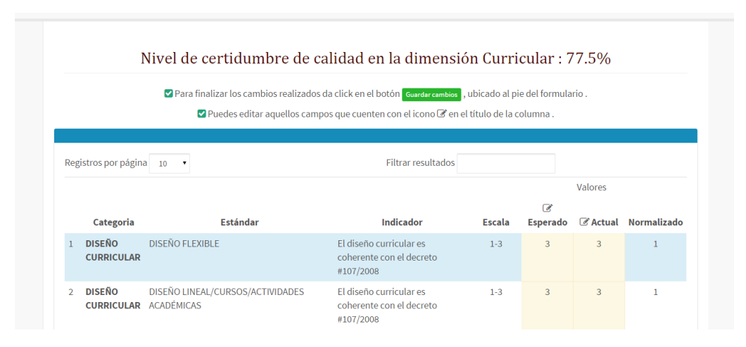
Figure 2. Computer design of the model of postgraduate quality assurance (Careaga & Meyer, 2013).