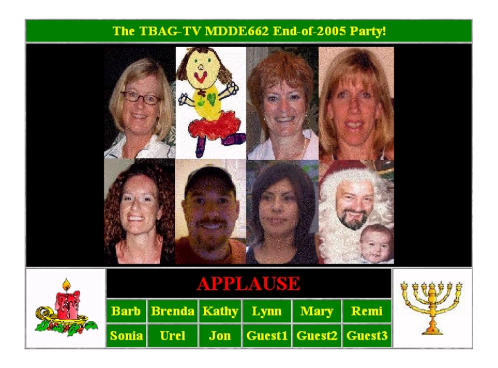
Figure 2. The selected image is pushed to participants on a 'transmission monitor'