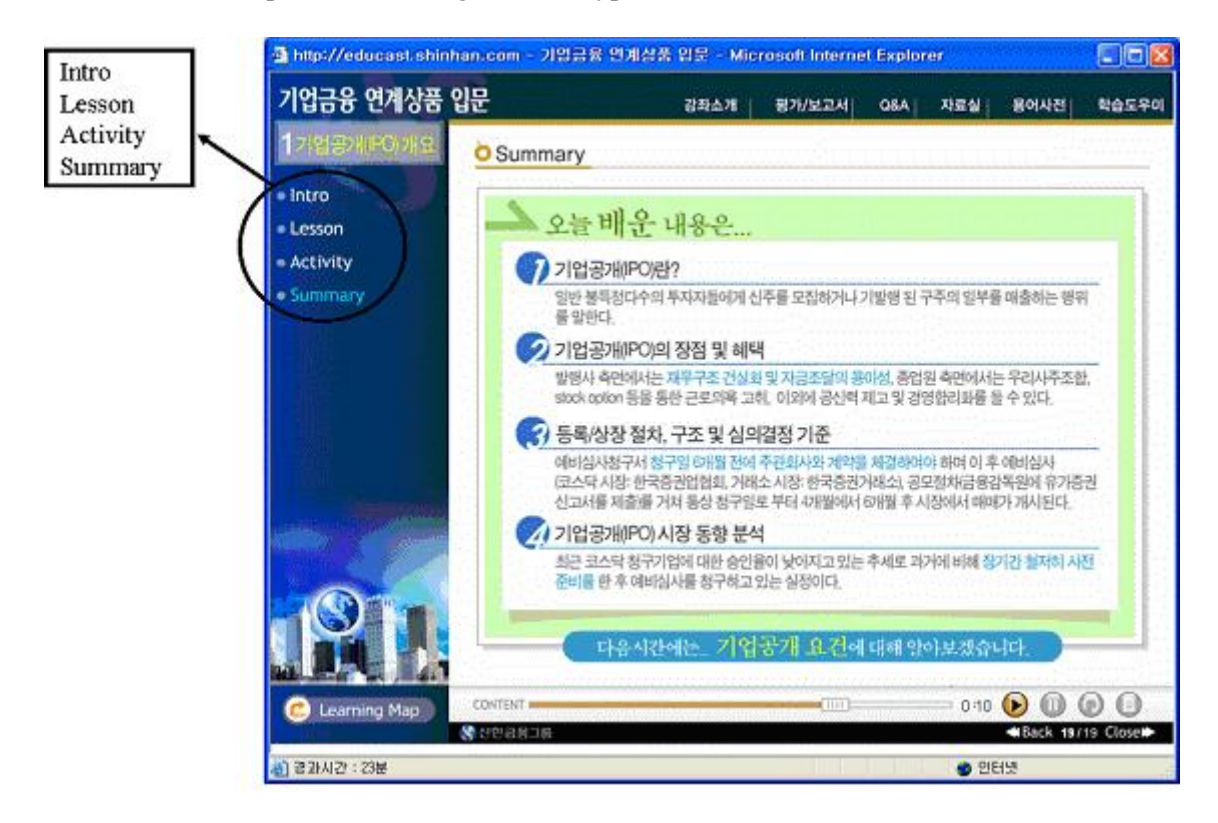
Figure 1. An Example of e-Learning: Tutorial type

Table 2 shows that nearly 90 percent of all e-Learning content in 2005 were tutorials in either HTML or Lecture-on-Demand (LOD) format. The remaining 10 percent were simulations that honed technical skills. As these two types – tutorials and simulations – became so ubiquitous over the past three years in the field of corporate e-Learning, the government's Employment Insurance Fund eventually dropped support for other types of e-Learning programs.