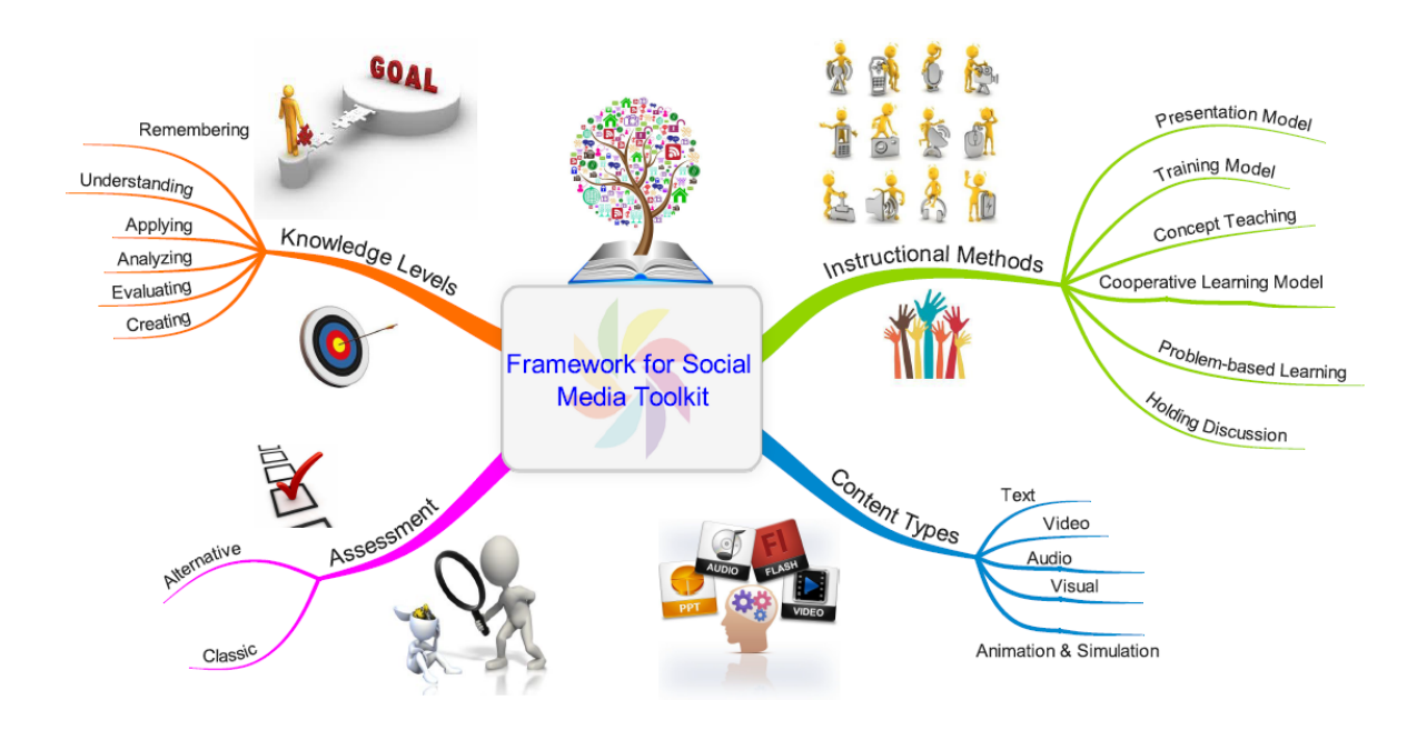
Figure 1. Framework for the Social Media Toolkit.

Instructional methods. Six well-known approaches to teaching (Presentation Model, Training Model, Concept Teaching, Cooperative Learning Model, Problem-Based Learning, Holding Discussion), three of which are teacher-centered and three student-centered, were the instructional methods selected due to their common usage (Arends, 2011; Borich, 2013; Burden & Byrd, 2013).