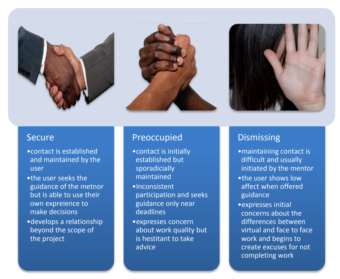
Figure 2. Understanding Virtual Attachment Theory.

dismissing attachment to their mentors who have mentors with a secure or preoccupied connection with their clients often do not maintain contact, make excuses early on in the project and ultimately may not complete the project or drop out of the program entirely. In practical terms this suggests that the level of collegiality among mentors and clients affects the relationship that the intern and client develop. Explicit, clear communication between clients, mentors, and interns during the virtual internship led to secure attachments and internships that ended in completed projects meeting all of the criteria.