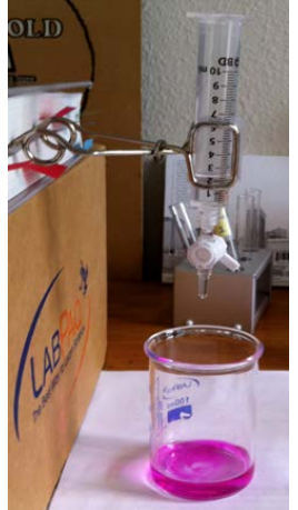
Figure 1. Student photographs showing a) a series of dilutions and b) the results of a titration.