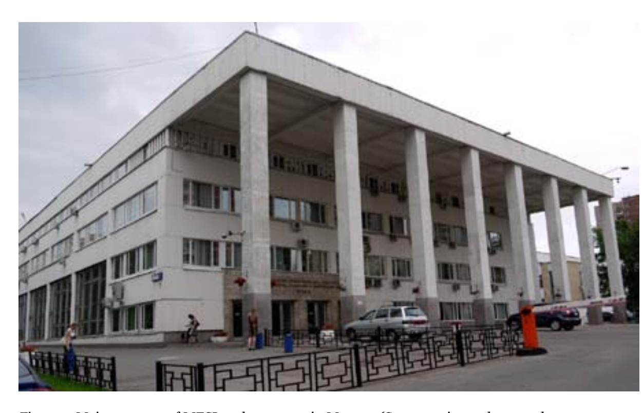
Figure 1. Main entrance of MESI at the campus in Moscow (Source: private photograph, June, 2010).

With the introduction of internet-based learning and teaching in 1992, MESI was one of the first to do so. Today MESI counts a total of 109,700 registered students, of which 9,200 are face-to-face students studying at the campus in Moscow. The average age of the students is 24; 63% of the students are female and 47% are male (October, 2010). Although its head-quarters is located in Moscow, MESI operates another 37 regional centres and branches at higher education institutions all over Russia, which can be compared to the system of study centres/regional centres at other distance universities, such as the FernUniversität Hagen in Hagen or the British Open University in Milton Keynes.