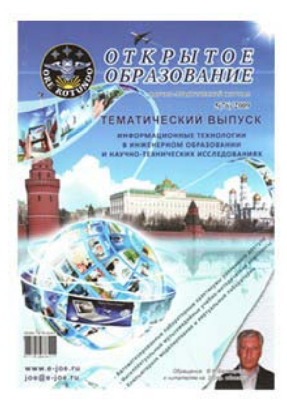
Figure 3. Journal cover of Open Education (2009).

Within the Russian literature the term distance education is similarly discussed but conceptually isolated from the older term correspondence education (cf. Ovsyannikov & Gustyr, 2001). This distinction is for example adopted by the Russian journal Open Education (Открытое образование), which can be regarded as equivalent to the prominent British journal Open Learning , yet the Russian version employs a greater focus on technological aspects of online distance education. Open Education was first released in 2002 and is published by MESI.